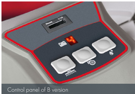
Control panel of B version