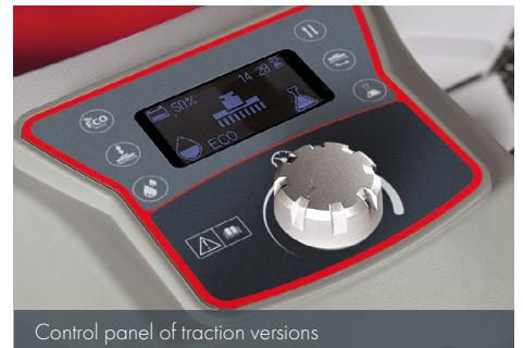
Control panel of traction versions

The simple control panel of (Antea 50 E/B) favours an intuitive use.