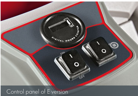
Control panel of E version