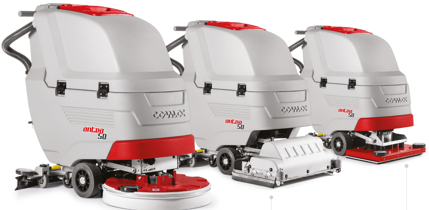
ANTEA 50 E/B/BT Scrubbing version with disc brush